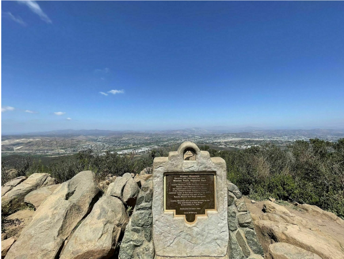
Top of Cowles Mountain, highest point in the City of San Diego

For those sticking around a little longer in San Diego craving some more outdoor activities. There are plenty of amazing hikes around the county but just a short drive from the hotel.